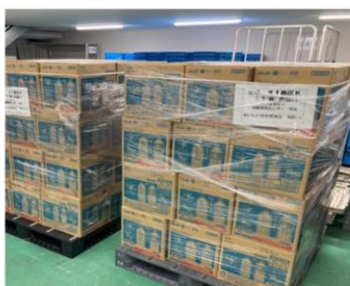
Nine tons of water have been sent from KSK Co., Ltd. The water has been distributed to employees and customers affected.