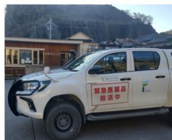
A disaster response vehicle provided by VITAL-NET, INC. is carrying supplies to affected areas.